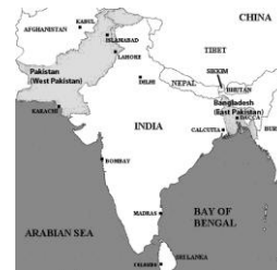
Map showing East and West Pakistan (1947-71)