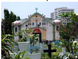
The Holy Rosary Church, Dhaka, built by the Portuguese in 1677.