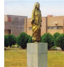
Statue of Begum Rokeya in Begum Rokeya Memorial Centre, Pairabondh, Rangpur