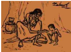
An image of the Bengal Famine by Zainul Abedin