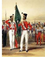
An image of the East India Company (EIC) Army

Plassey's Legacy: young Londoners explore the hidden story of the East India Company (2010).