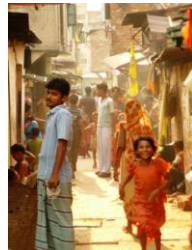
A scene from the Geneva Refugee Camp in Dhaka